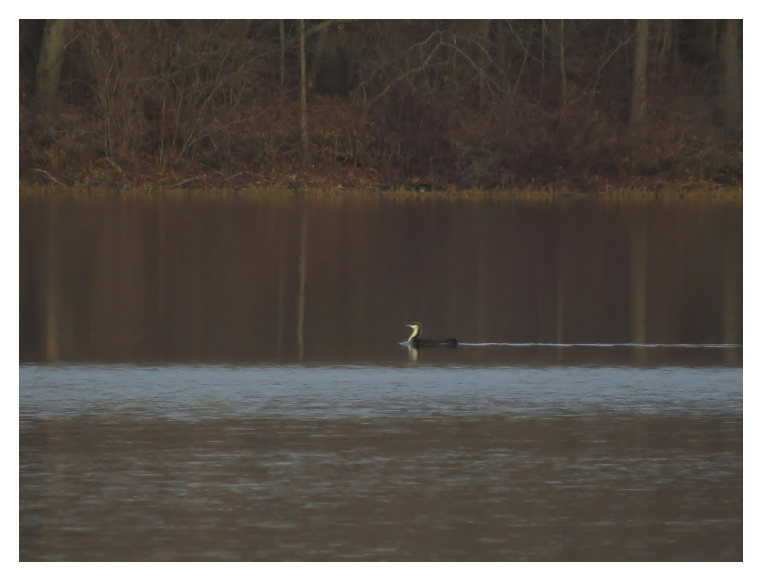
Pacific Loon, Mercer, PA 3.JPG